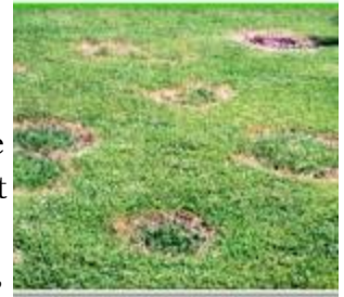
Necrotic Ring Spot

A turf disease/fungus is more common than most people are aware of and can cause turf to be temporarily or permanently damaged. Diseases are more prevalent during the summer months, but can attack your lawn throughout the year-even in the winter. Turf diseases tend to be influenced by many factors, some of which you can't do much about. Relative humidity, temperature, rainfall and other weather patterns are most influential-and uncontrollable. On the plus side decreasing the thatch layer, relieving compaction, proper mowing practices, correctly irrigating and regular fertilizations are factors that can be manipulated to benefit your lawn. Fungi tend to be naturally